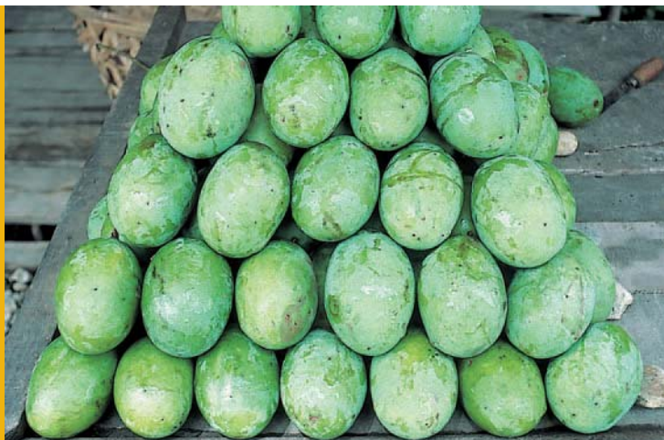
Mangifera odorata on sale at a roadside market stall.