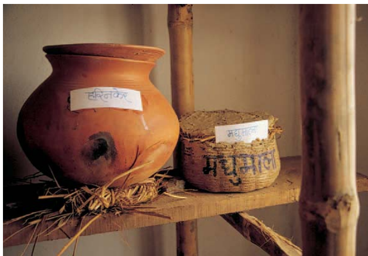
Farmers not only still grow traditional varieties in Bara, Nepal, but they also store them in traditional clay pots, sealed with animal dung to keep insects out.