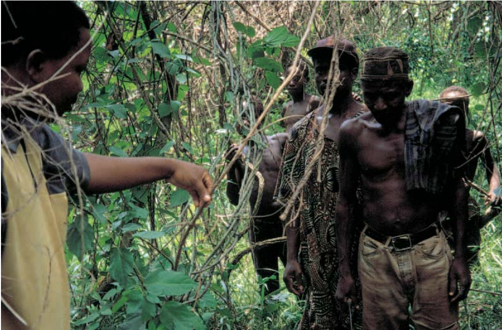
Farmers in Benin examine the thorny stems of a wild yam.

each harvest the tubers of the individual plants that most nearly approach their ideal of a domesticated variety and plant these the following year. The study could find no relationship between the methods used and any aspect of the outcome.