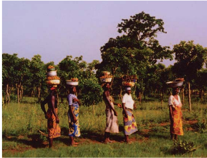
Women in Ghana carrying shea ( Vitellaria paradoxa ) fruits, one of the more important forest products. P. Lovett

The big surprise was that many species could indeed be stored, if handled properly. Just under half (46%) of the 61 species screened had seeds that could be dried and stored. A