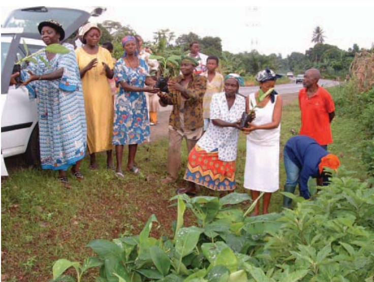
Women from the village of Loum 99 in Cameroon gather to unload healthy plants supplied by the project. A. Nkakwa Attey

The final strand is particularly innovative as it closes the cycle, making the project both self-sustaining and capable of rapid expansion. At the