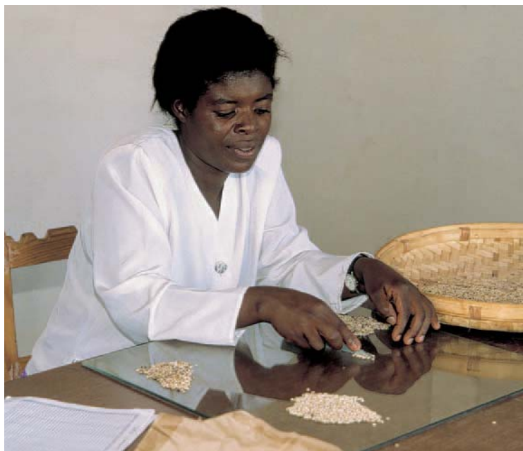
At a community genebank in UMP District, Zimbabwe, local people clean the seeds before storage. The Trust encourages genebanks to work with farmers.

The study drew largely on information gathered by FAO in 2000 from about 100 countries. Its findings were alarming: not only is crop diversity disappearing from the fields, but also a large proportion of the crop resources 'safeguarded' in genebanks around the world could soon be lost due to lack of funding. The report found that while the number of samples held in crop collections has increased in 66% of countries since 1996 (the last time FAO gathered such data), genebank budgets have been reduced in 25% of countries and have remained static in another 35%. Not surprisingly, the majority of budget cutbacks have taken place in the poorest countries, which are home to the diversity of the world's most critical crops.