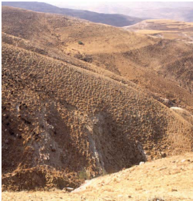
Overgrazing, seen here on the outskirts of Amman, threatens the long-term future of agriculture in much of Jordan.

Farmers are well aware of the root cause of water scarcity. They mention increases in population, which lead to house-building and deforestation, which in turn take both land and water from agriculture. They also shared some of the traditional practices that make better use of land and water. One of these is known as shigag , which involves allowing animals to graze narrow strips across the slope of a hillside. Land prepared in this way absorbs more of the winter rain and gives a better harvest the following year. Another technique involves building sand walls along the contours, which again slows down the runoff of rainwater and thus ensures better penetration for the following season's crops.