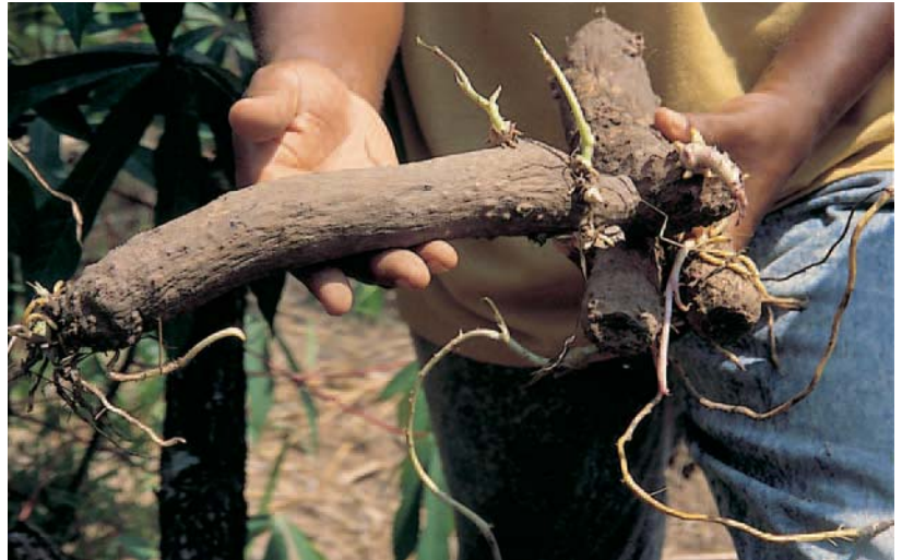
Domesticated yams, as seen here, have thicker tubers and less thorny stems.

Farmers do not actually appreciate that yams produce true seed and that they are using selection from true seed as a method to create and select improved clones. This offers great opportunities for improving the yam crop through participatory breeding. Already one researcher from the University of Benin has established a non-governmental organization specifically to work with farmer-breeders. In the future, one can imagine breeders making deliberate crosses of favoured cultivars in order to supply farmers with seed to assess and domesticate. Farmers, too, can be taught about true seed and encouraged to think of ways to incorporate this knowledge in their individual breeding efforts. Either way, the close study of domestication as practised by the yam farmers of Benin indicates not only the value of maintaining diversity in the areas around the farms, but also the vital part that their domestication plays in securing their food supply and improving their livelihoods.