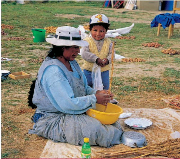
Workers clean seed before it enters the national Andean Grain genebank in Peru.

The IPEE will decide the preferred legal status, governance and financial mechanisms for the Trust, based on consultations with a large number of governments, individuals and organizations, South and North. The Interim Panel will also decide upon questions like the proper balance to be achieved in the allocation of funds. The Panel will hold its first meeting in early 2003. (Further information on Trust governance can be found at http://www.startwithaseed.org/pages/governance.htm .)