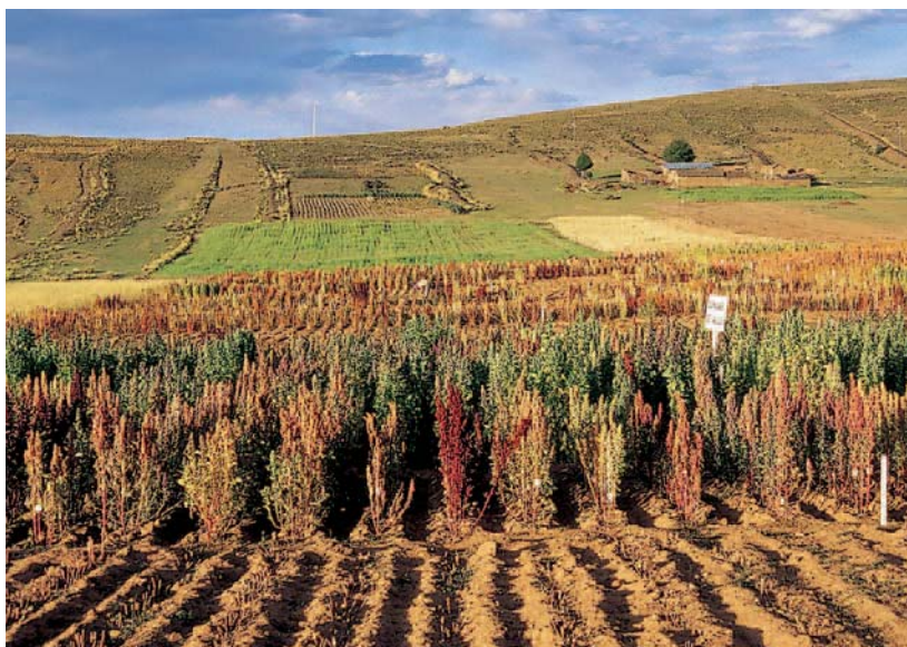
In Bolivia Fundación PROINPA holds 2727 varieties of quinoa. All are being evaluated to see which would be most useful.

The Turkish trader does the final processing and packaging and sells into the European Union market, where consumers pay the equivalent of about Euro 27.00 per kg. That is a final markup of more than 3800% from the child gathering the capers to the shopper in the supermarket. If just a little more of that could be passed back to the families it would make a