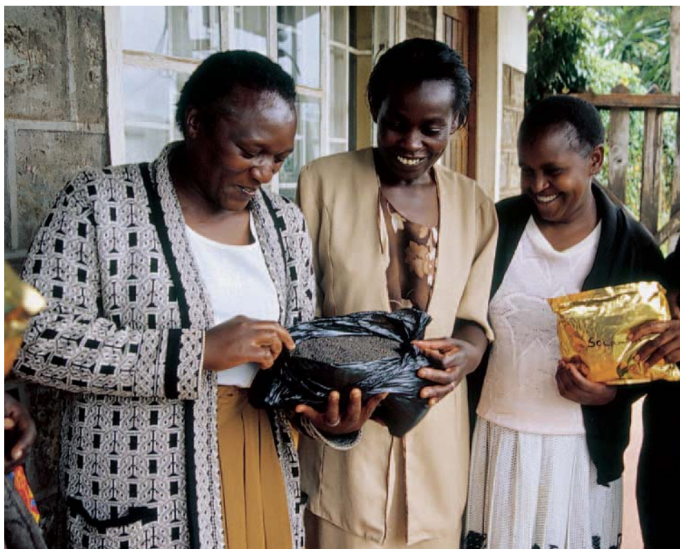
The Karanje Limuni Women's Seed Saving Group in Santa Monica, Kenya, is helping to ensure that people can buy good seed of local leafy vegetables.

health, with the incidence of obesity and diseases such as diabetes and heart disease growing dramatically among the urban poor. In diet, as in agriculture, diversity is often of value in its own right. A rounded nutritional strategy will make use of a mutually reinforcing cycle of improvement.